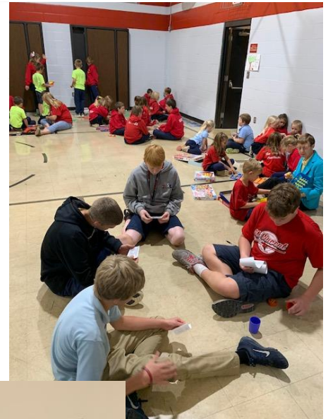
(Right) Students enjoying 1st Qtr. AR celebration with board games, sweet treat, and quality time together!

St. Vincent School Society Event - Thank you for your support!!!