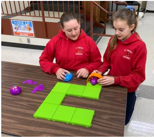
Students enjoying STEM activities from the Scenic Library. They practiced coding, robotics, and engineering.

The Scenic Regional Library hosted a fantastic STEM day filled with a variety of stations, including robotics, coding, and engineering. Our students received many compliments from the librarians and multiple volunteers. Way to go Redbirds!