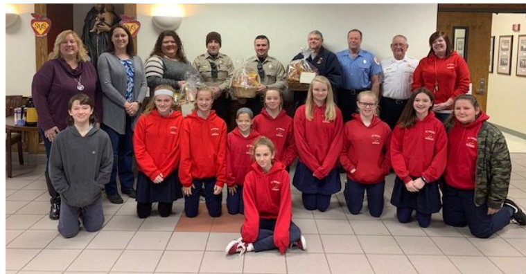
Above: Our student leaders gave first responders gratitude baskets for their services.

Students and staff enjoyed the week celebrating our Catholic education. Thank you for letting us be part of your family and educate your children! We raised $145 for the first responder baskets. The firefighters, police officers, and first responders were extremely humbled to be recognized by our community for their services.